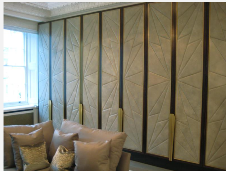
Margan® bespoke wall panels