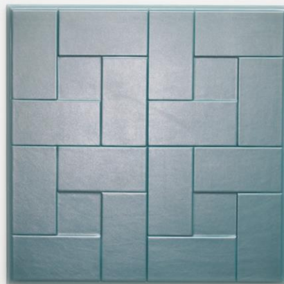
Margan® Mirage wall panel