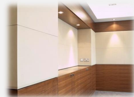
Margan® Classic wall panels