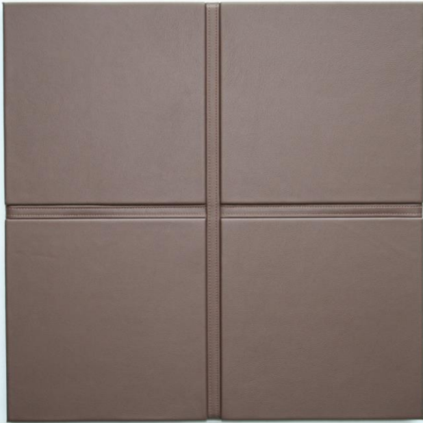
Margan® Saddle strap wall panel with lock stitch strap detail

Artistry in Leather Designers and Manufacturers of the Finest Bespoke Panels