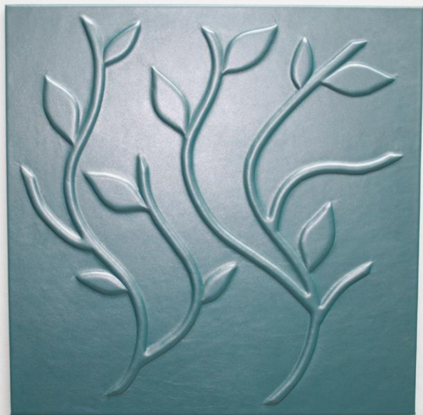
Margan® bespoke wall panel

Panels are supplied with a unique fixing system which gives an invisible, flush fit to all our designs.